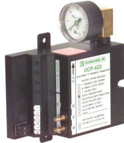
SHOWN WITH OPTIONAL PRESSURE GAUGE